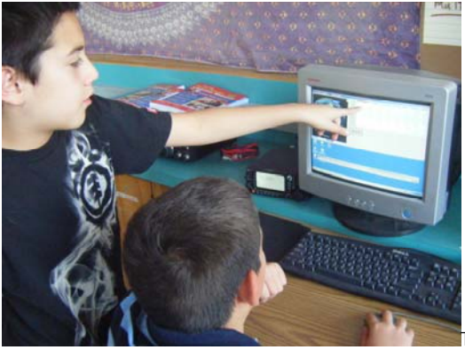
The student pointing to the screen is reading the azimuth and elevation of the satellite to the second student who is verifying the data.