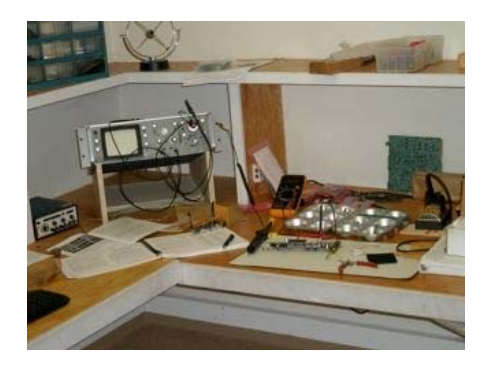
Here is our station as it stands now. Right now we are using my Icom IC-706mkII from home until the kids finish building the Elecraft K2 that you provided under the grant.