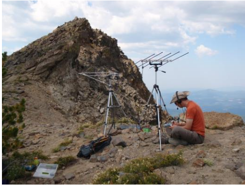
Portable ham radio in Lassen Volcanic National Park.