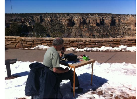
A one-man ham radio station on the South Rim of Grand Canyon National Park.

Some Amateur Radio groups may wish to have a larger display of Amateur Radio's capabilities and interact with the public; we have instructed such groups to pursue a Special Use Permit with the NPS unit in question.