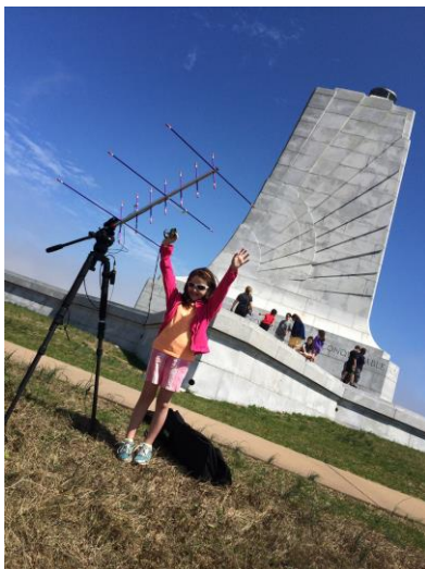
This 9-year-old ham at Wright Brothers National Monument talked to other hams through a satellite.