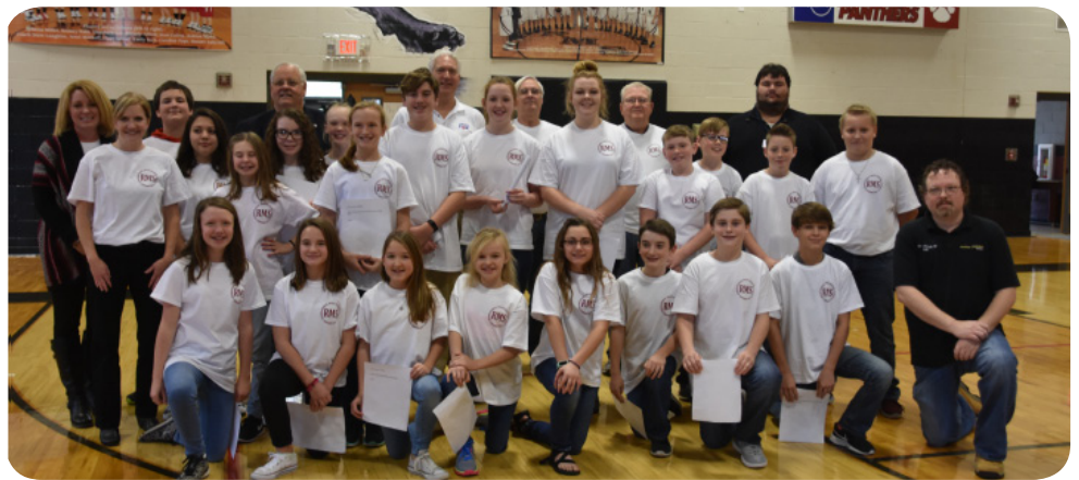
The team involved in the ARISS contact at Rainbow Middle School in Rainbow City, AL.