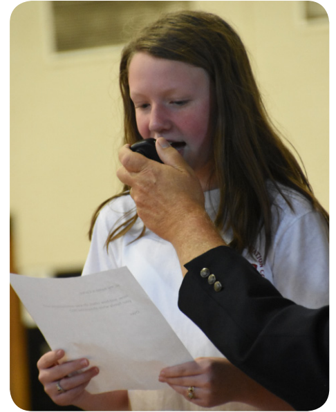
A student at Rainbow Middle School takes her turn at the mic to ask a question of astronaut Shane Kimbrough, KE5HOD.

~~~~~ For information about upcoming ARISS contacts, visit www.ariss.org/upcoming-contacts.html .