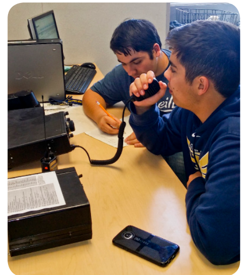
YHS Ham Radio Club members on the air.

I applied for and received the club call sign W6YHS, and then, with the sponsorship of my local club, San Geronio Pass Amateur Radio Club (W6PRC), applied for an ETP grant. The application was successful, and soon we had a Yaesu FT-991 radio. W6PRC continued to support us, serving as mentors and donating time, talent, equipment, and skill. They even purchased a mini tower for our antenna. W6PRC has run joint Field