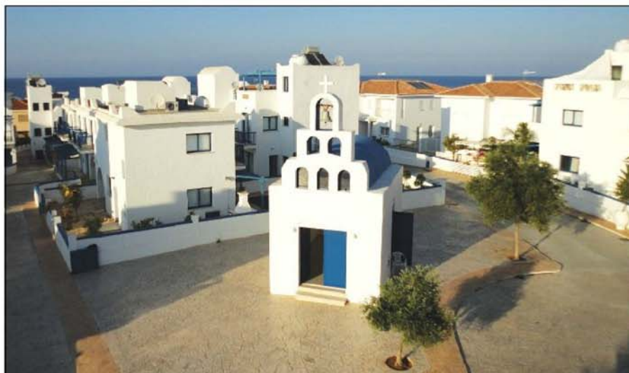
Figure 2 — From the third floor balcony of our hotel room in Protaras we had a beautiful view of the Mediterranean Sea. It was a great location for a Buddipole.