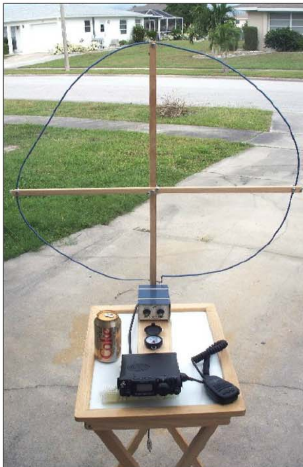
Figure 2 — This first attempt at a small loop theoretically should not have worked but stations in New Mexico and North Dakota didn't know this.

can't be attached to your vehicle). At the other end of the spectrum, you can hike to a remote peak in the dead of winter and risk frostbite while erecting an antenna on a rocky escarpment to activate a summit for the first time. Activators can be spotted on the SOTA website or they can be self-spotted if cell phones work up on the summit. For information on the program go to www.sota.org.uk .