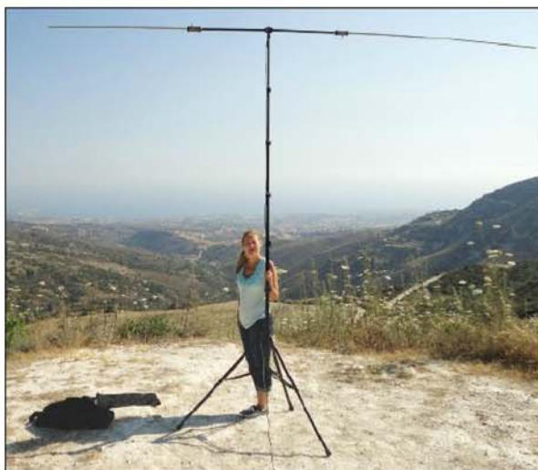
Figure 7 — We drove up into the hills near Peyia and found this great overlook to operate from. During our DXpedition, my mom, Carolyn Lysandrou, KC9URR, often benefited from the “YL factor” in piling up contacts.

We were located at the far southwest corner of the island, near the Akamas peninsula and as we traveled farther southwest we encoun-