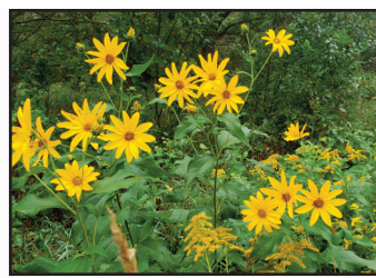
Readers photos pg 9