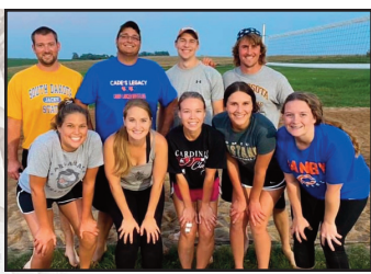
Volleyball champs pg 6